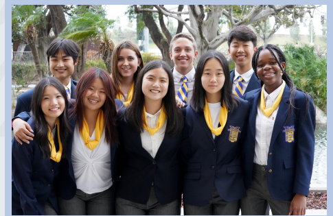
CA FBLA Executive Board @ LDI!

CA FBLA had a very successful 2022 Leadership Development Institute! From October 21 to 23, chapters from all across California came together in Anaheim to engage in a number of guest speaker events, socials, and other activities to grow business knowledge and network with one another! LDI 2022, themed, "Imagine," encouraged members to allow their creativity take the helm; by doing so, the possibilities are truly endless. For months, the CA FBLA Executive Board has been giving it their all to provide all of our members the best experience possible! Through three officer-led workshops titled, Imagine the Possibilities , Imagine the Other Side , and FBLAst Off! members had a variety of opportunities to engage in fun activities while learning important leadership lessons.